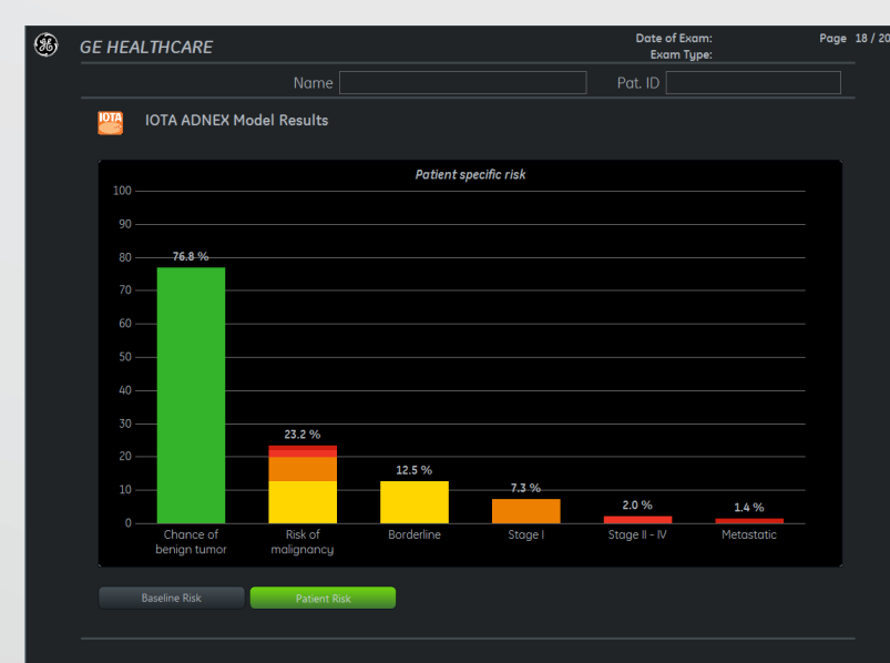
Van Calster B, et al. BMJ 2014;349:g5920.